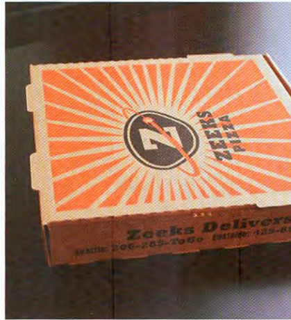
Zeeks (above and opposite page) elevates the dial-and-dine experience with flat-out delicious pies.